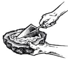
Fig. 3 Apply mortar