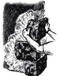
Fig. 4 Install corners first