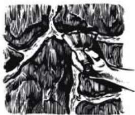
Fig. 8 Whisk away loose mortar

COMPLETION Sealing the stone is not necessary, however it may be desirable for attaining deeper colors and for minimizing possible staining in certain applications such as "at grade", where mud might splash onto the stone or on fireplaces which are exposed to smoke and soot. Only good quality masonry sealers that are of the "penetrating breathable" type and either Silane or Siloxane based should be used. The sealer should be tested for color change on several loose stones before application, as sealers will darken stone.