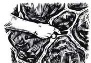
Fig. 7 Finish joints