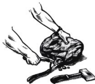
Fig. 2 Trim stone to fit