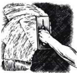
Fig. 1 Prepare surface

3 DETERMINE THE SQUARE FOOTAGE OF FLAT STONES REQUIRED for the project by multiplying the lineal footage of corner stones needed by 1/2 (One lineal foot of corner stones equals approximately 1/2 square foot of flat stone) and subtracting this corner square footage from the total project square footage. This will give you the square footage of flat stone required. However, some extra quantity of flats is desirable for best fitting and for cutting and trimming.