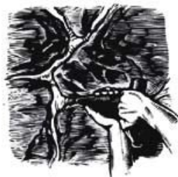
Fig. 6 Grout joints