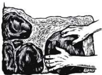
Fig. 5 Then install flat stones

TRIMMING STONES For best fit, stones can be cut or shaped using a hatchet, widemouth nippers or a mason's trowel edge. Straight cuts can be made with a diamond or carbide saw blade. Cut edges